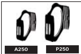
A or P System ?