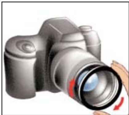
Screw the adaptor ring onto your lens.