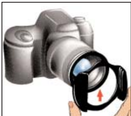
Slide the filter-holder on the adaptor ring until it snaps in place.

System "P" rings in 48 / 49 / 52 / 55 / 58 / 62 / 67 / 72 / 77 / 82 mm and Hasselblad B50/B60/B70 and Rollei VI rings.