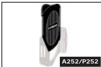
Cap on filter-holder