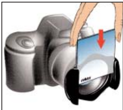
Slide the filter into one of the filter-holder slots.

The filter-holder is now solidly attached to the lens, yet it can rotate both left and right.